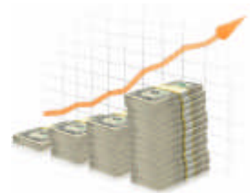
Unlock significant savings with one-time professional services

From historical audits to contract negotiations, our one-time professional services can kickoff your TEM program or be an add-on geared to identify further efficiencies after implementation. Asentinel provides the following a la carte options to accelerate optimization of their telecom programs: benchmarking, contract negotiation, historical audit, inventory build / validation, network optimization, service optimization and staff augmentation.