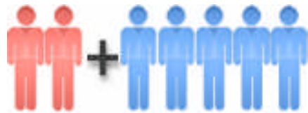
We'll support your team or be your team.

Let CommSouth's team of telecom experts handle any and every aspect of your telecom expense management program. We