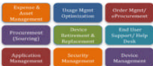
Full wireless lifecycle management

Take control of wireless with Asentinel's WEM solution set. Wireless invoices are landmines of extra charges and hidden fees that can be easily spotted and disputed with Asentinel . The application also provides visibility of current usage and spending, giving you the Business Intelligence to optimize plans and renegotiate rates. Our managed and professional services team can streamline all of your wireless processes from initial provisioning to end-of-life retirement. Services include eProcurement, help desk, BES support, optimization, policy management and fulfillment / kitting.